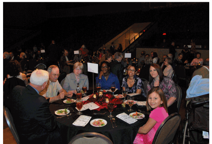
Residents of Bridges Safehouse were honored guests

Visit our website at www.Bridgessafehouse.org